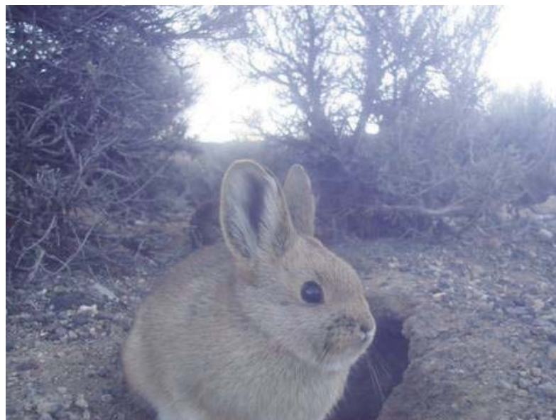
Fig. 2. Images of pygmy rabbits from photographs taken in south central Utah by Digital Ranger S600 SB CamTrak cameras.

cameras. At the resolution settings we used, cameras were capable of storing over 900 images, and we encountered few problems with full memory cards or faulty cameras. Nonetheless, in the event that a memory card became full or a camera quit working before it was collected, we determined the elapsed sampling time from captured images. We placed cameras